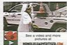
See a video and more pictures at HONOLULUADVERTISER.COM

outperformed by peers in several places including China, Singapore, Japan and Russia. Hawai'i's fourth- and eighth-graders scored a math grade of C+ and C, respectively.